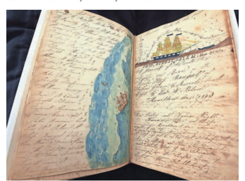
An entry in the logbook from the whaling ship Bengal, out of Salem, Massachusetts.