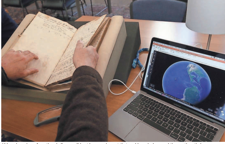
Although mariners from the whaling era did not have equipment that could precisely record the weather observations reflect a common language learned over their years at sea. nent that could precisely record the weather, their