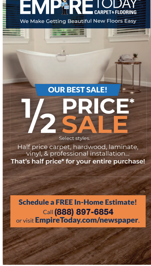
Discount is applied to the regular price of select styles of blinds, basic installation, and take Excludes miscellaneous installation charges and prior purchases. Product may not be sold from installation. Residental installations only, Not available in all areas. Valid through 11 Subject to change. Details at EmpireToday.com. Sales (except CA and MA) and installation are provided by independent contractors. Licensure at EmpireToday.com. CSLB 1047108