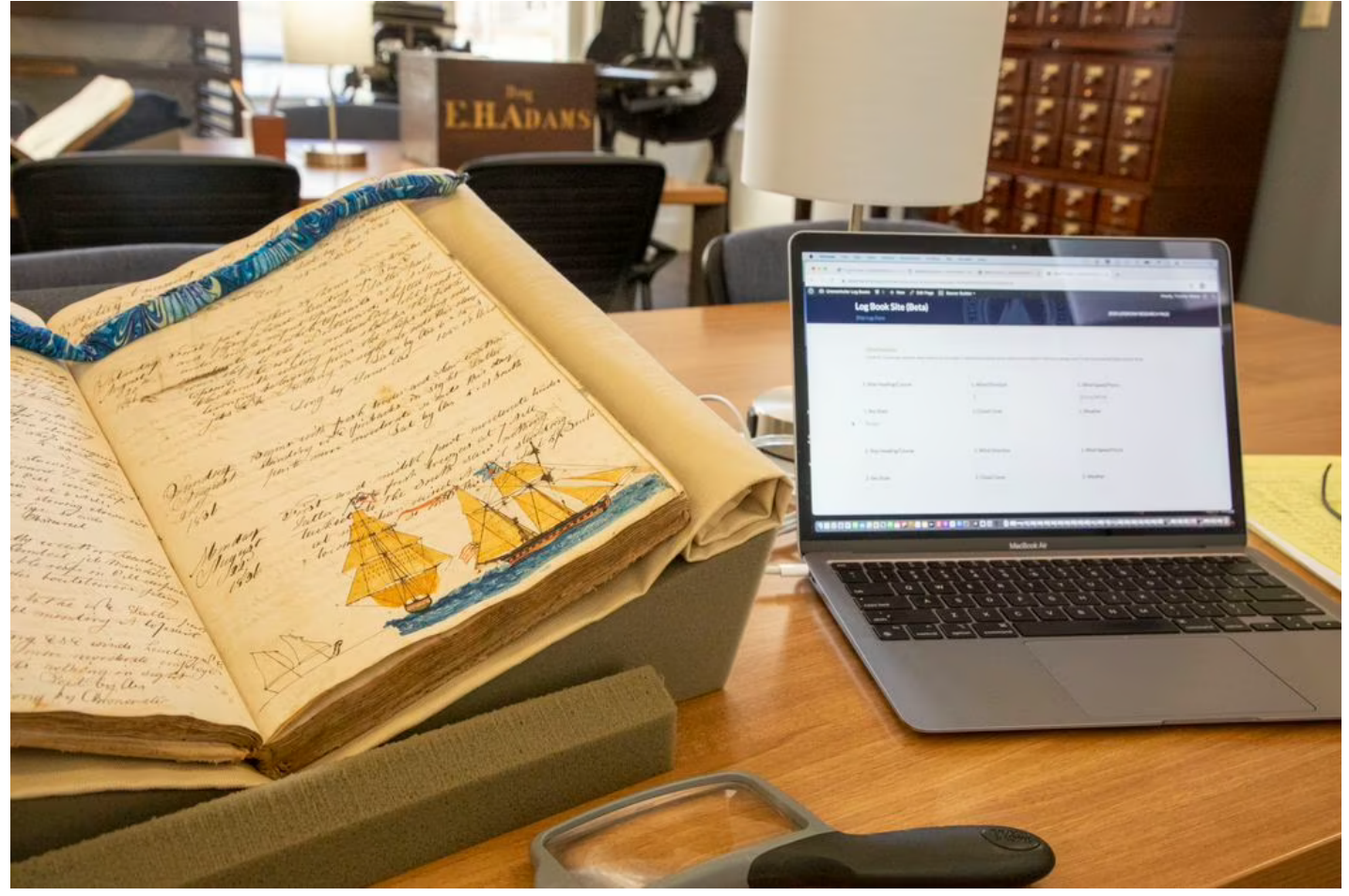
Researchers have studied about 100 whaling logbooks to analyze historic climate patterns.

The logbooks, handwritten records on yellowed paper, are housed mainly in the New Bedford Whaling Museum, which has the largest collection of whaling records and journals in the world, about 2,500 logbooks, Walker said.